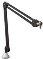
Studio arm (PSA1 - optional)