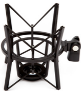
Shock mount (PSM1 - optional)